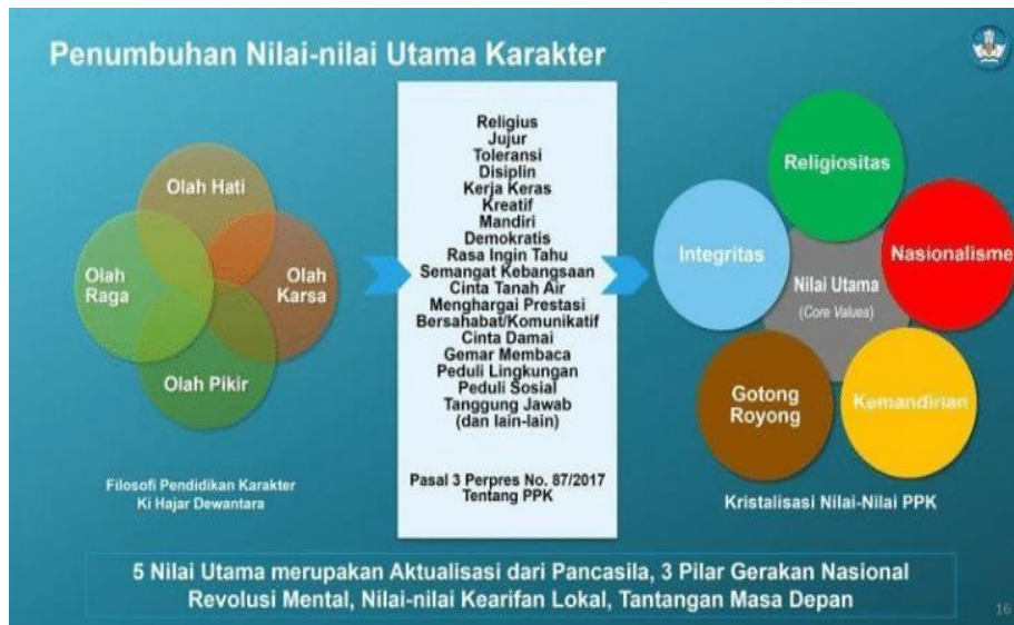
Figure 2. The implementation of PPK system within the ministry of education and culture

The provision of character education in Law No. 20 of 2003, which aims to form strong student characters with an emphasis on integrity, needs improvement and innovation in its implementation. Therefore, the push for character education in Indonesia needs to be implemented with the right methods. In response, schools in Indonesia have initiated an appropriate strategy in the form of a character education program known as Strengthening Character Education (PPK). Policymakers recognize the urgency of education as the key to addressing the existing challenges of character value deterioration, which is reflected in the Presidential Regulation of the Republic of Indonesia No. 87/2017 on Strengthening Character Education (PPK). The underlying philosophy lies in the development of at least 18 character values, which are grouped into five aspects of the PPK concept, namely religiosity, integrity, nationalism, independence, and cooperation (Kurniasih & Utari, 2017).