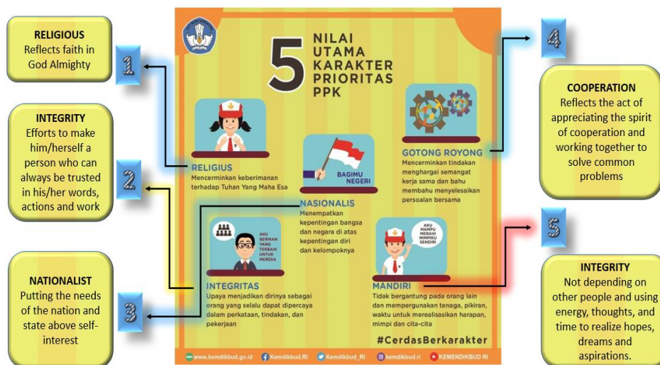
Figure 3. Five main values of strengthening character education (PPK)

The figure above shows that PPK divides character values into four main aspects to create a whole human being, including heart processing, literacy, aesthetic processing, and physical activity. These four aspects become the foundation for the formation of civilized humans who are healthy, intelligent, respectful, and have high integrity (Hayati et al., 2020). Based on the figure explained that The character values targeted in Indonesia come from various sources such as religion, Pancasila, cultural wealth, and national education goals is regulated in the Presidential Regulation of the Republic of Indonesia No. 87/2017. These character values include being religious, truthful, tolerant, disciplined, hardworking, creative, independent, democratic, curious, nationalist, homeland love, respect for achievement, communication skills, being peaceful, being literate, environmental awareness, social care, and responsibility (Hidayati et al., 2020). The 5 PPK values scheme is described in more detail in Figure 3 below.